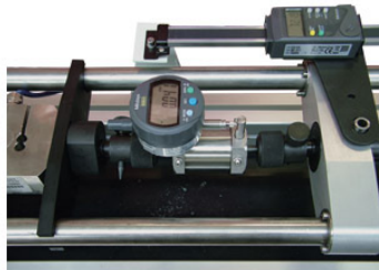
OPTIONAL EXTENSOMETER (SM1002A) FITTED TO TL SPECIMEN