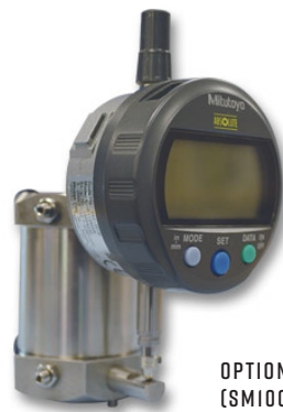
OPTIONAL EXTENSOMETER (SM1000D)