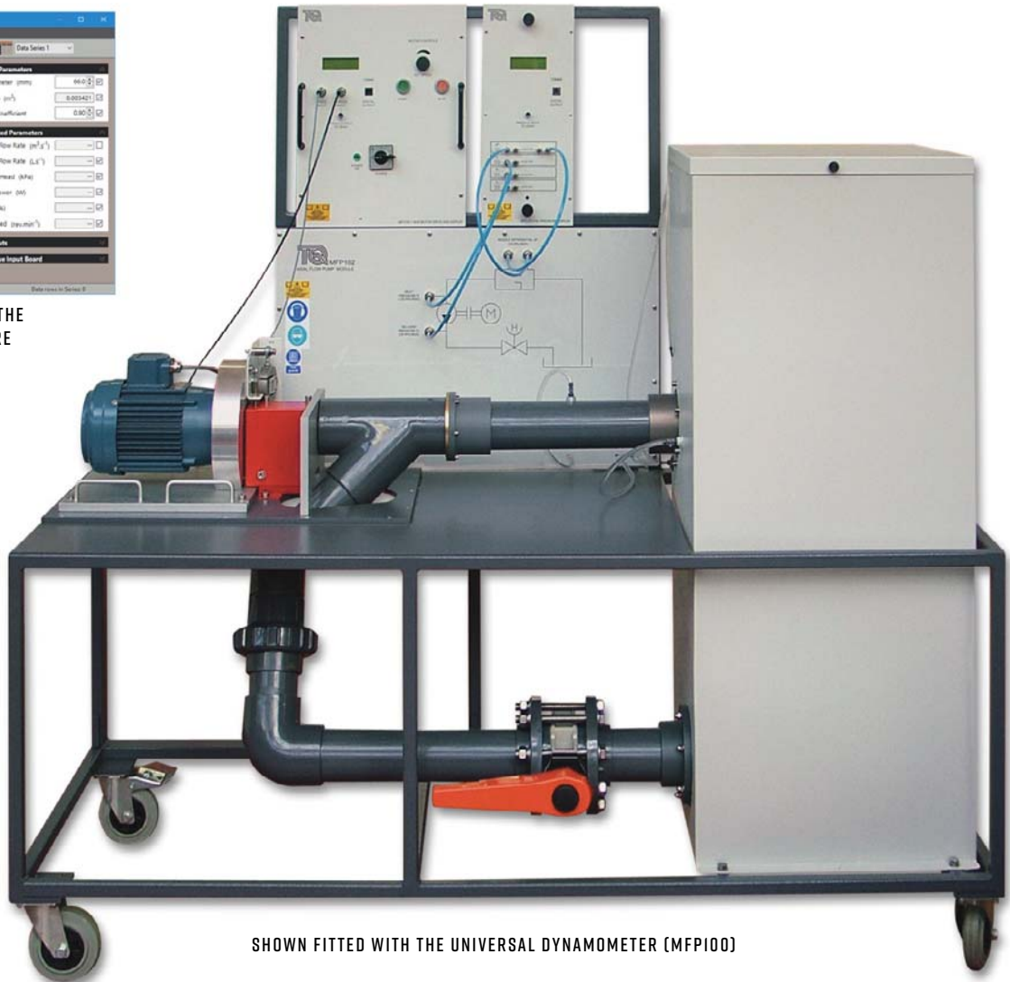
SHOWN FITTED WITH THE UNIVERSAL DYNAMOMETER (MFP100)